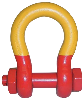
Safety Pin Shackle