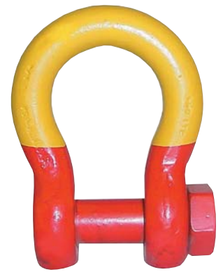
Screwpin Shackle Hex Head Pin or Marine Hex Head