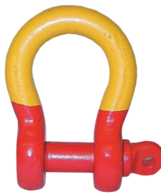
Screwpin Shackle Eyed Pin